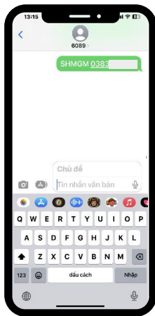
Referrer sends SMS to 6089

SHMGM<space>[REFEREE’S MOBILE PHONE NUMBER]